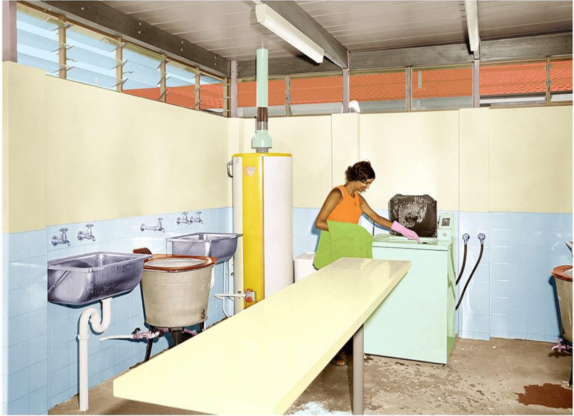
First Jobs, Housekeeper 1975