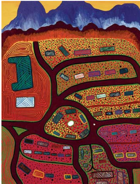
Adrian King The New Site 1999 Synthetic polymer paint on canvas 108 x 83cm Private collection