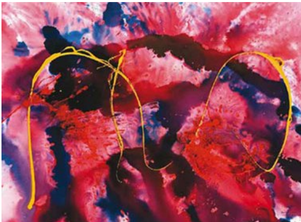
Samantha Hobson Bust 'im Up Again 2001 Synthetic polymer paint and glaze on canvas 125 x 171cm Private collection