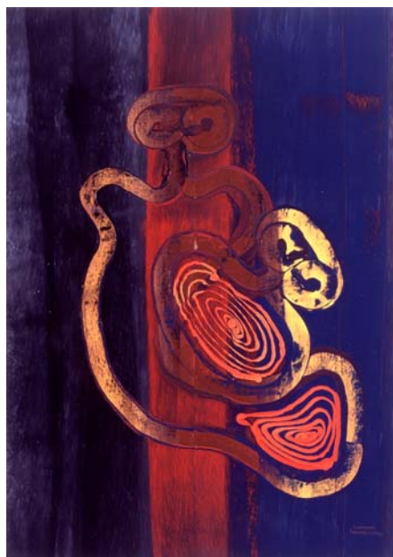
Fiona Omeenyo Mother and Child 2004 Synthetic polymer paint on canvas 115 x 81cm Private collection

Fiona Omeenyo's figures derive from the Quinkan spirit figures found in rock art in the Laura region to the south of the artist's Umpila country. The artist became a mother at a very young age and now has three children. The family bond between different generations of family is a particular preoccupation with the artist and this image we see different ways that the artist depicts connections between mother and child. The artist often depicts lines of connection between parents and children, and runs these lines through to ancestral generations of the family.