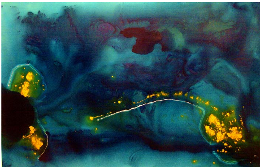
Samantha Hobson Flying over the Reef Synthetic polymer paint on canvas 183 x 285cm Private collection

'Pama Malnkana' – 'people of the sand beach'